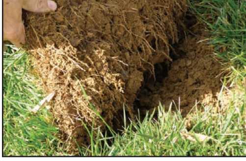
Tombstone Tall Fescue sinks deep roots to reach available water underground.

Tombstone was developed from two cycles of phenotypic selections. In the spring of 2000, 21 plants were selected on the basis of increased growth activity, vibrant and dark genetic color, improved density, general freedom from disease and uniform height and maturity. The 21 clones were combined in an isolated polycross nursery and produced F1 seed in 2000. Approximately 45% of the 1000 plants in the F1 nursery were removed prior to pollination to produce cycle 1 seed in 2001. Approximately 21% of the 1000 plants in the cycle 1 nursery were removed prior to pollination to produce cycle 2 breeder seed in 2002.