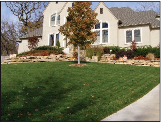
Tombstone Tall Fescue looks like Kentucky Bluegrass, but is castly more drought tolerant.